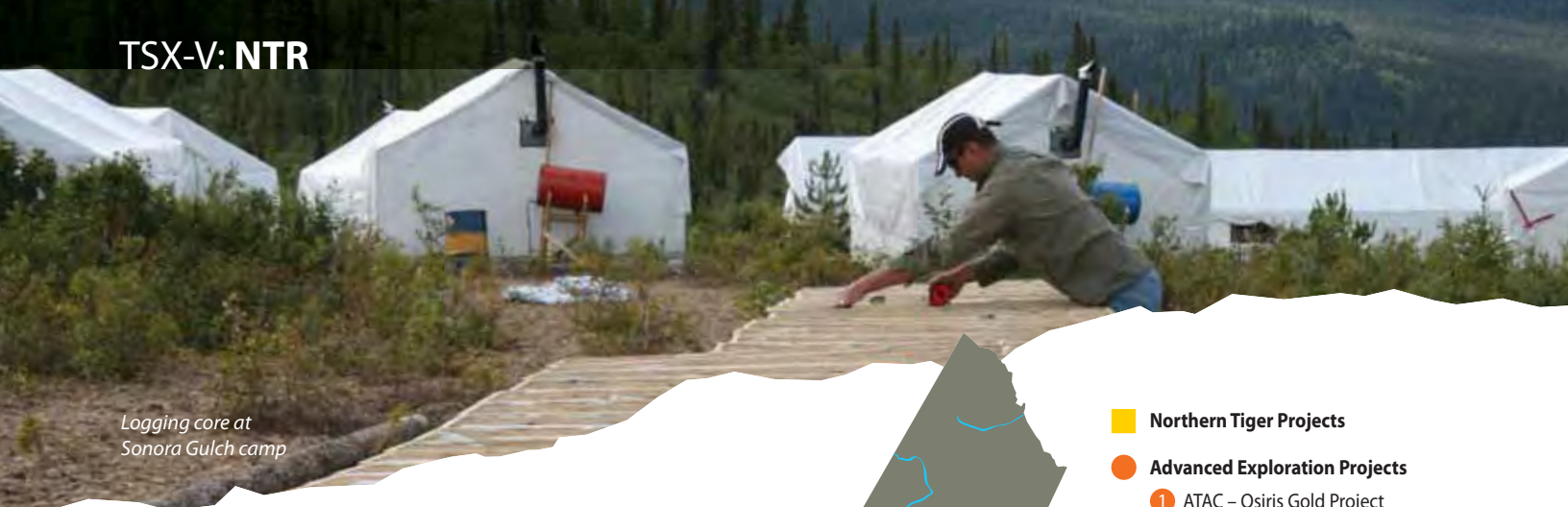
Logging core at Sonora Gulch camp