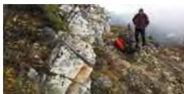
Top: High-grade gold discovered at 3Ace Bottom: Surface quartz vein containing visible gold at the 3Ace Project